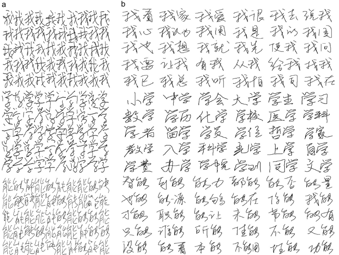
Fig. 2. Some handwritten Chinese character samples from the SCUT-COUCH subset GB1 and Word8888: (a) 50 handwritten samples of three Chinese characters from SCUT-Couch GB1 subset and (b) the handwritten word samples contributed by three different writers that contain the corresponding three Chinese character “我” “能” “学”, respectively.